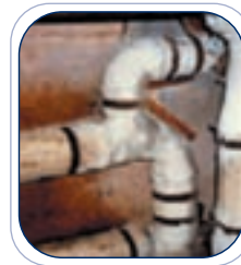
Asbestos Pipe Lagging

FOR FURTHER DETAILS AND A NO OBLIGATION QUOTATION CALL 01283 515485 OR VISIT WWW.ASBESTOS.IT