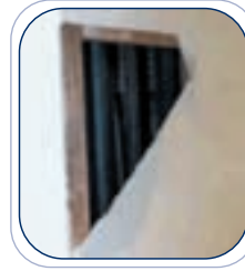
Damaged AIB Wall